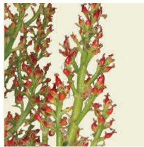
Early nut development

Repeat 2 - 3 weeks after first application, during nut development